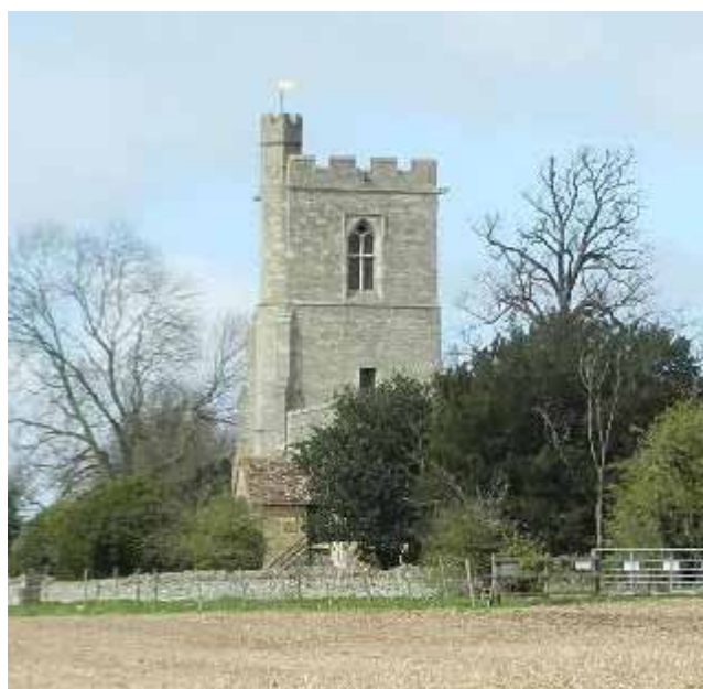
St Owen's Church tower

This walk takes you on a journey through several millennia of human habitation from prehistoric settlements to Anglo-Saxon mills and from medieval manors to twenty-first century developments.